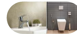
Bath fittings and sanitaryware