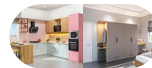
Kitchens and Wardrobes