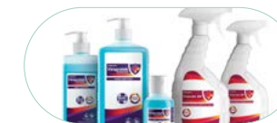
Sanitizers and Surface Disinfectants