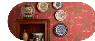
Wall Coverings (Nilaya range)